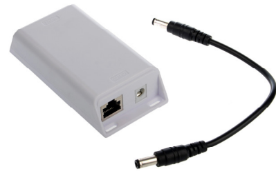
Gigabit PoE splitters for DC, USB and USB-C