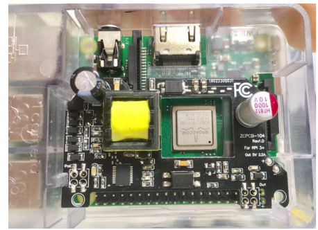
in Canakit case