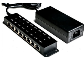
Injector for 8 devices