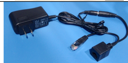
Injector for 1 device

URL: shopify.poe-world.com Technical Support: poe-world.com